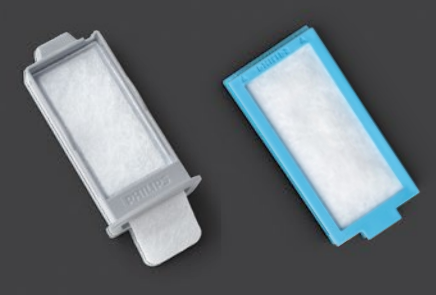
Reusable pollen filter