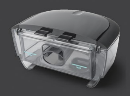
Water tank with lid